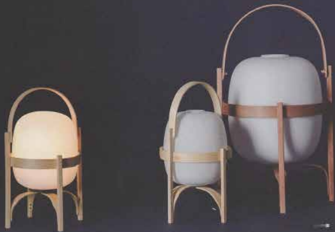
Cesta Family by Miguel Milá Discover more at santacole.com